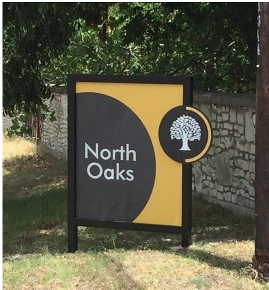
NEWCNA was proud to install these neighborhood signs. Now we need your help to make sure they keep looking their best!