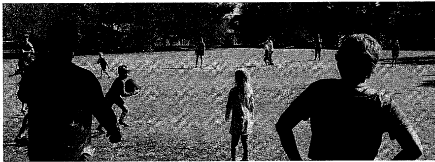
Generally it's a very friendly atmosphere and a fun way to spend a Sunday afternoon.

Game play is delightfully chaotic with casual tag outs to comfort crying toddlers and sodas set down to play occasionally spilling on the "field" which is just the big open grassy space at North Oaks neighborhood park. Scores are kept on a white board casually propped against a tree but it's not really about who wins and loses its about enjoying the company of your neighbors. A couple dogs are present though leashed to the park tables nearby, and some people have brought snacks and drinks to share. If you aren't into kickball there is also a slackline often set up temporarily between two trees. Several kids who came to the park with their families but aren't inclined to play kickball traverse the slackline comedically waving their arms about and giggling wildly.